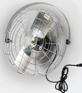
2-Bladed Circulation Fans

Shutters can provide an easy and affordable means of controlling incoming light and building climate. Cumberland shutters are available in white or black PVC, galvanized with epoxy painted blades and durable aluminum.