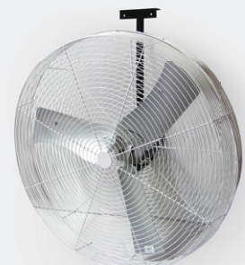
3-Bladed Circulation Fans

Factory assembled, pre-wired, circulation fans are available in 18", 20", 24" and 36" diameters for light air movement. These highly efficient fans include 1/10 HP "TEAO" motors and galvanized props for whisper quiet operation. Other features include permanently-sealed bearings, automatic thermal overload protection, and PVC coated guards.