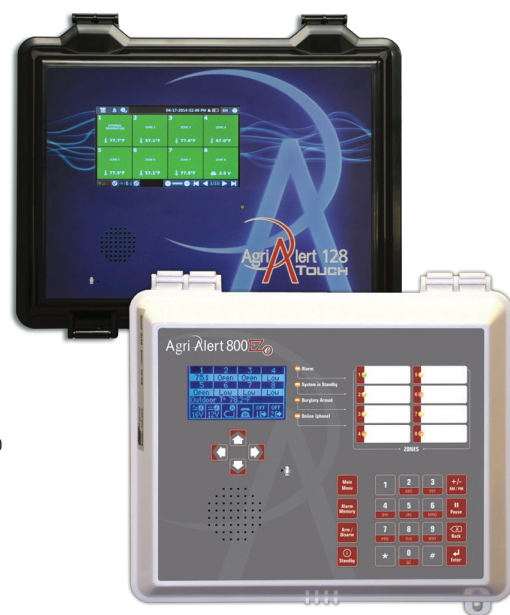
AGRI - ALERT™ 800EZE