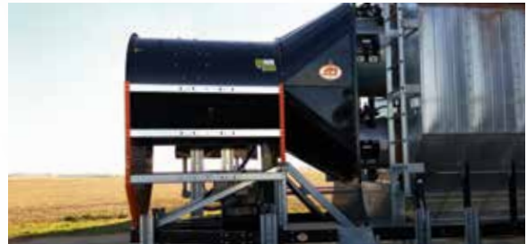
Dry/Cool Quiet Dryer (Q200 Series)