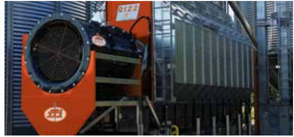
Single Plenum Quiet Dryer (Q100 Series)

FFI Stacked Quiet Dryers use a dry/cool 50/50 lower module. Like all models in the FFI Quiet Dryer line, they are 50% quieter than vane axial stacked portable dryers, with no loss in capacity and even, consistent plenum pressures.