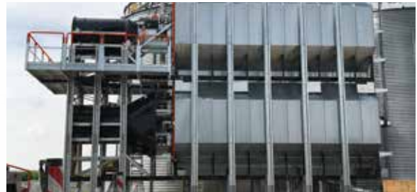
Stacked Quiet Dryer (2Q00, 3Q00, Q400, Q600 Series)