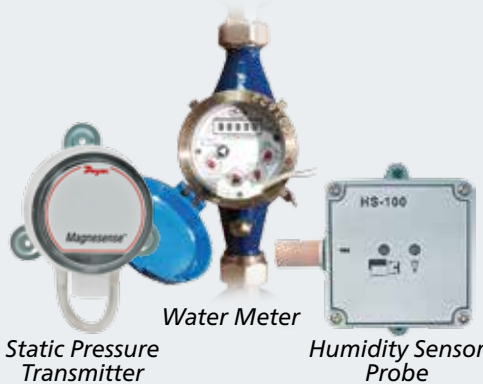
Static Pressure Transmitter