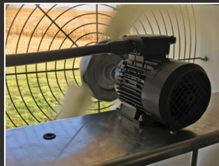
High performance, permanent magnet motor runs cool to the touch and supplies constant torque to the propeller.