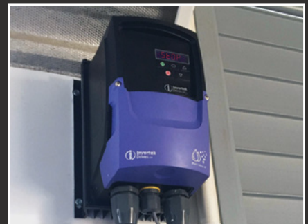
Industry leading drive allows for the use of failsafe relays or back-up thermostats as required.