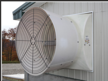
Durable fiberglass and poly cone options

Plan your next ventilation strategy with the 36" or 54" Commander direct drive fans built for high efficiency, high output, and remote access through your EDGE® control system.