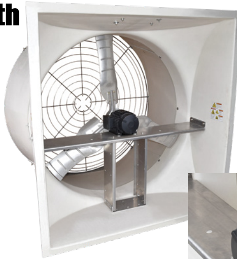
ALUMINUM MOTOR MOUNTS, STAINLESS STEEL HARDWARE AND NON-CORROSIVE PROPS