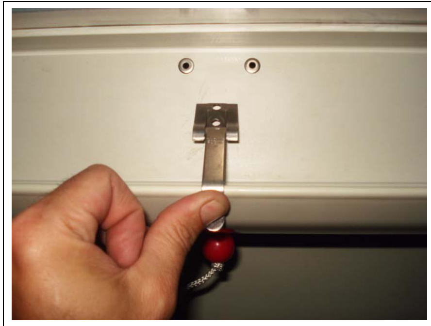
Figure 1 Center between Rivets and Push up on Tab

Step 1: Center the 30-0570 latch between the two (2) rivets on the long side of the inlet frame, while pushing up from the tab as shown in Figure 1 .