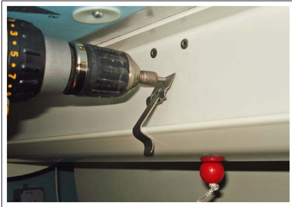
Figure 3 Screw Latch Base to Panel

Step 3: Finish driving the top screw into the panel ensuring the latch remains vertical. The screw will pull the base down to the panel. (See Figure 3.)